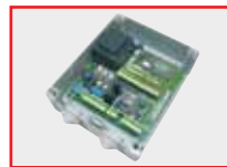
D113693 00001 RIGEL 5 120 V NO CAPACITORS