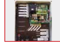
KERIG4C040U RIGEL 4 LE 12x14 NO CAPACITORS 12" x14" large fiberglass enclosure. Pre-wired with Rigel4