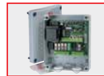
KD113236 00003 RIGEL 4 120V (NO CAPACITORS)