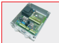
KD113693 00001 RIGEL 5 NO CAPACITORS Rigel 5 115 vac with built in 433 receiver