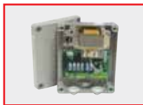
D113198 00001 ARIES UL/CSA