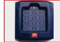
P121024 - Q-BOX Digital keypad with 10 channels and 100 combinations. Backlit