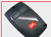
D111904 Mitto 2 Transmitter: 12V Two channel 433Mhz rolling code remote control