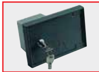
N574005 - SIBOX Empty safe for external release and control push- button panel. Dimensions: 7"x5"x3' 1/2."