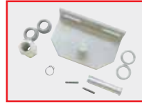
N999177 - PARTS KIT Kit for Joint/Igea arms