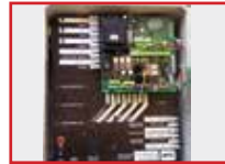
KERIG5C040U RIGEL 5 LE 12X14 NO CAPACITORS 12" x14" large fiberglass enclosure. Pre-wired with Rigel5