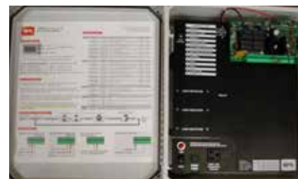
12 x 14 LEB enclosure with battery backup

Control unit compatible with the EELink protocol.